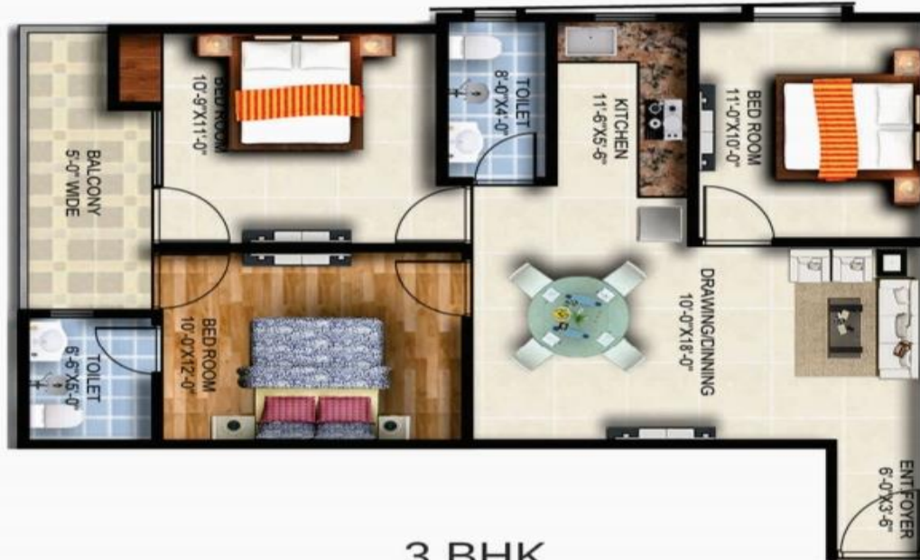
3 BHK AREA-1192 SQ.FT.