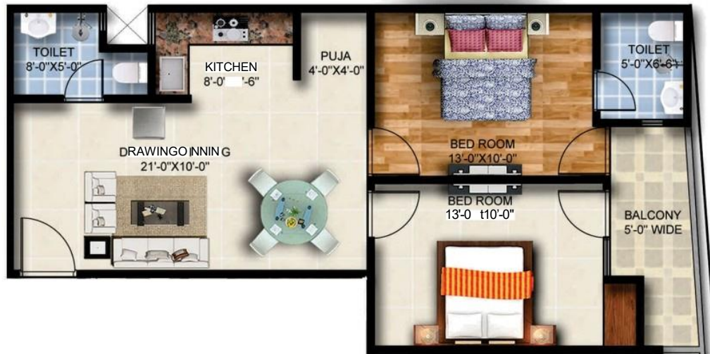
2 BHK+PUJA AREA-1050 SQ.FT.