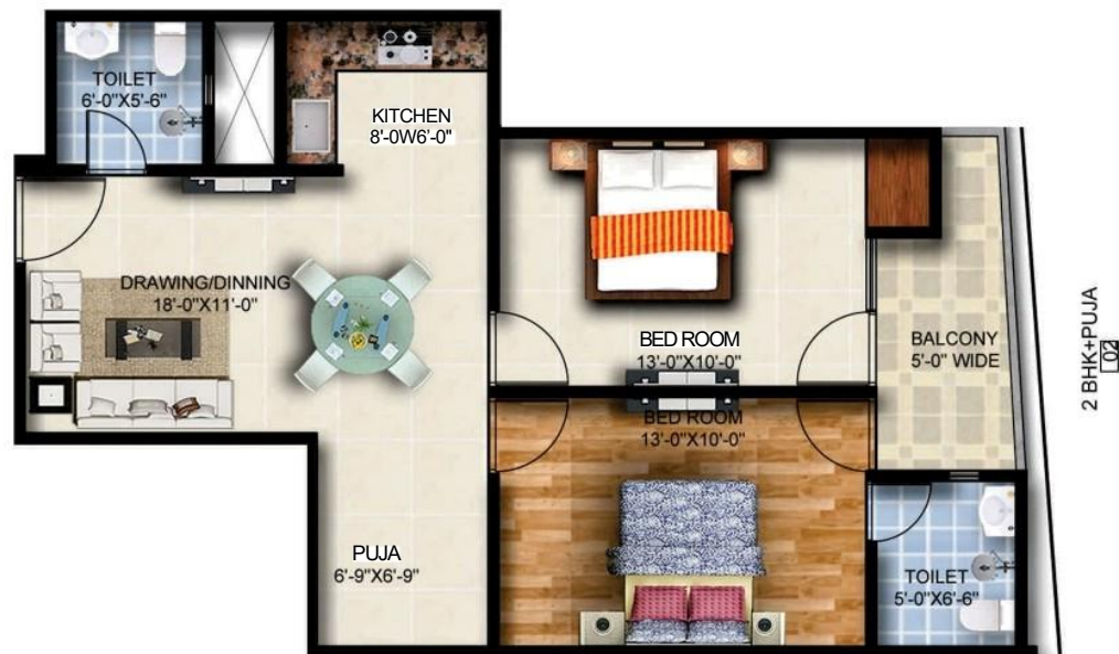
2 BHK+PUJA AREA-1092 Sq.FT.