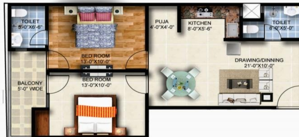
2 BHK+PUJA AREA-1084 SQ.FT.