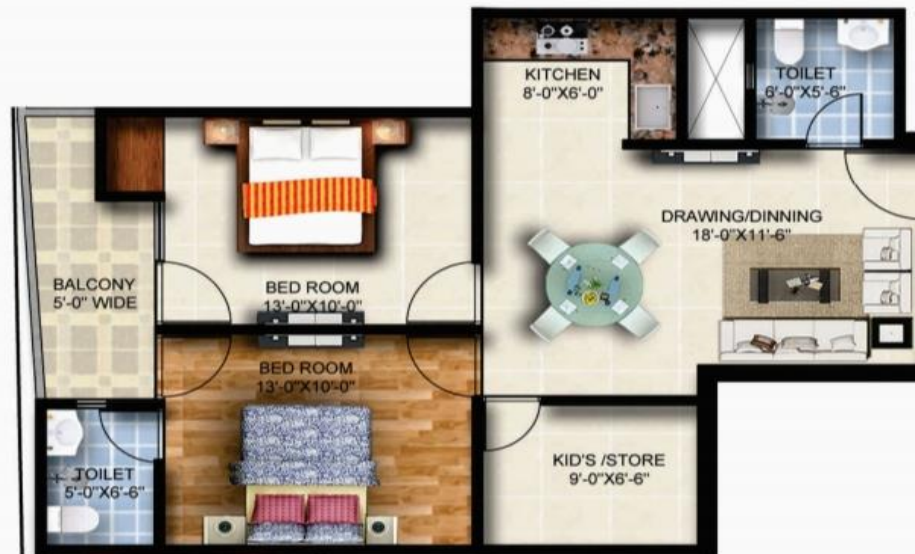
2 BHK+KIDS/STORE AREA-1104 SQ.FT.