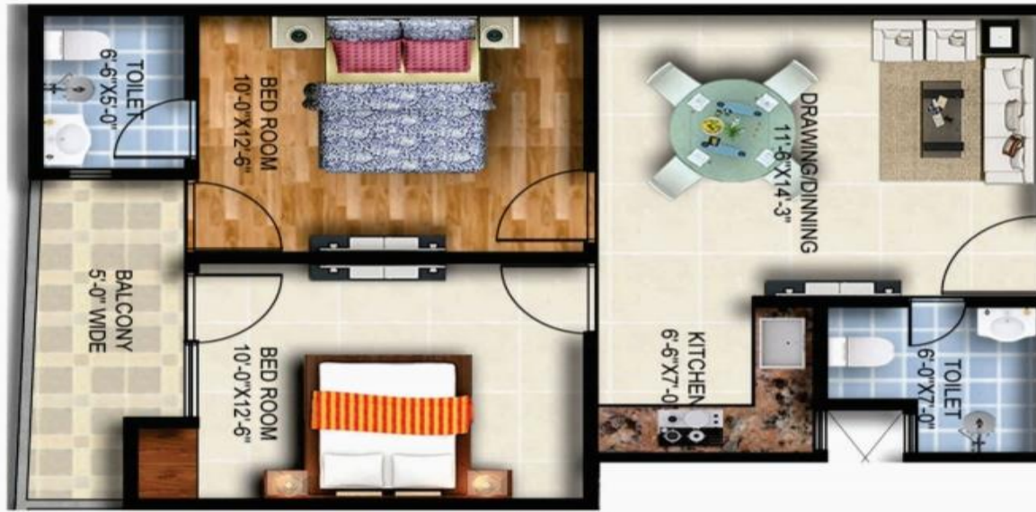
2 BHK AREA-979 SQ.FT.